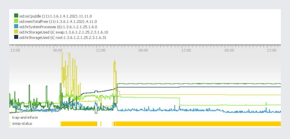
Figure 1: Resource Monitoring

The Black Duck fuzzer includes support both for browsing and selecting SNMP values as well as built-in automated support for using an SNMP oracle. The diagram (refer to Figure 1) shows a graph of resource consumption during fuzz testing.